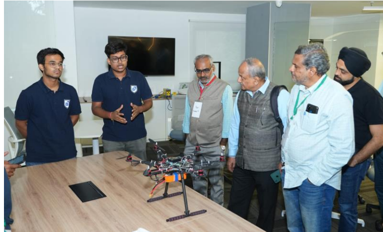
We were a part of the joint speaker meet on Wednesday 9th September at Vasavi Convention Centre.