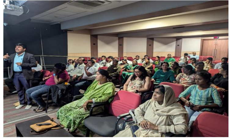
Dt: 02 Oct. 2024: The Headmistress of Sahakari Vidya Kendra School has invited Our Club Members to be a part of Gandhi Jayanti celebration. The program was scheduled between 8:00 am to 9:00 am. 6 Members of our Club graced the occasion. The drawing competition winners were awarded today and chocolates were distributed to the entire school. The program was a grand success